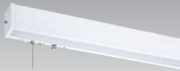
Two lamp OM Series in white finish.

OM Series White or Walnut Finish fixtures are designed with switchable general or task lighting levels, built-in night light and convenience outlet.